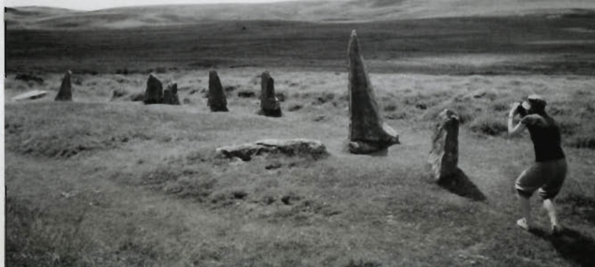
Dartmoor Arts Summer School at Scorhill Stone Circle

An exhibition of entries to the recent Dartmoor Preservation Association's photographic competition.