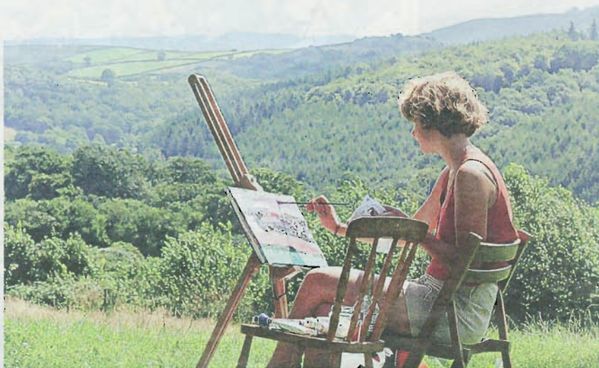
Dartmoor Arts summer school