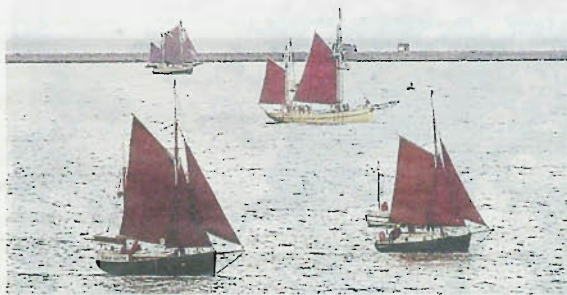
Plymouth Classic Boat Rally

More than a hundred luggers, ketches, pilot cutters and other historic craft are expected to be in Plymouth at the weekend for the city's annual celebration of classic boats.